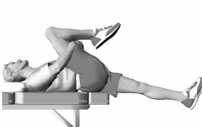
Figure 2 Stretching the psoas muscle performed in supine position by flexing the contralateral hip and knee, extending the ipsilateral leg and holding the position for 30 seconds.