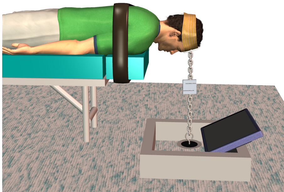
Figure 1 Isometric neck extensor muscles endurance test performed in the prone position with visual feedback.